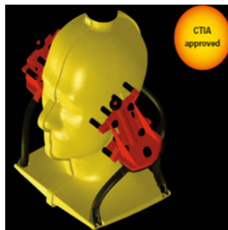
Fig. 2. SAM Phantom. The red devices are clamps to hold the cellphone in a specified location. “CTIA” is the Cellular Telecommunications Industry Association.

A study of temperature controlled human sperm placed 3 cm beneath a laptop computer connected to Wi-Fi for 4 h [39] reported, “Donor sperm samples, mostly normozoospermic [normal sperm], exposed ex vivo during 4 h to a wireless internet-connected laptop showed a significant decrease in progressive sperm motility and an increase in sperm DNA fragmentation.” The study concluded “Ex vivo exposure of human spermatozoa to a wireless internet-connected laptop decreased motility and induced DNA fragmentation by a nonthermal effect. We speculate that