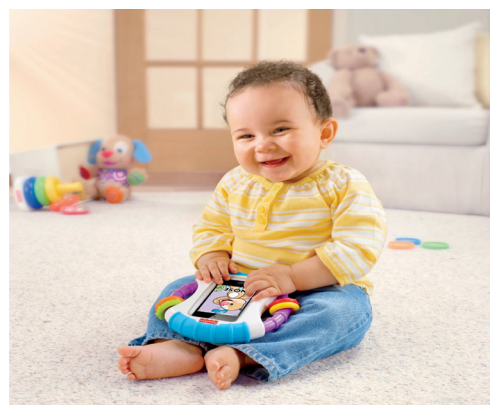
Fig. 3. An iPad placed within a rattle. Note the device is immediately over the boy's testicles.

Digital dementia also referred to as FOMO (Fear Of Missing Out) is a real concern. A science publication's review