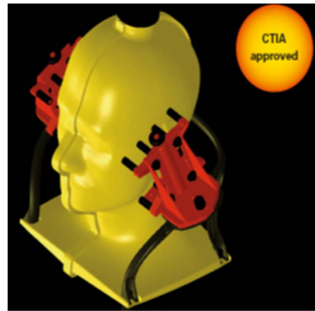
Fig. 2. SAM Phantom. The red devices are clamps to hold the cellphone in a specified location. “CTIA” is the Cellular Telecommunications Industry Association.

A study of temperature controlled human sperm placed 3 cm beneath a laptop computer connected to Wi-Fi for 4 h [39] reported, “Donor sperm samples, mostly normozoospermic [normal sperm], exposed ex vivo during 4 h to a wireless internet-connected laptop showed a significant decrease in progressive sperm motility and an increase in sperm DNA fragmentation.” The study concluded “Ex vivo exposure of human spermatozoa to a wireless internet-connected laptop decreased motility and induced DNA fragmentation by a nonthermal effect. We speculate that