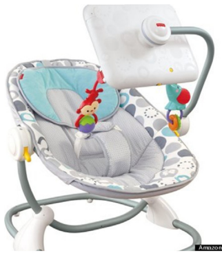
Fig. 5. An iPad for entertaining a baby.

article describes the problem in great depth [45]. An empirical study of the problem was published in 2013 [46].