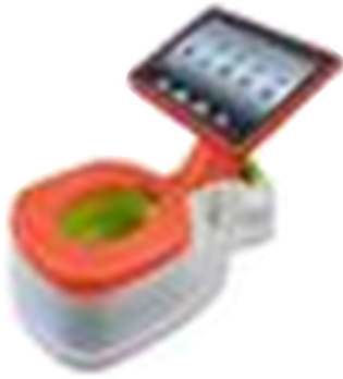
Fig. 4. 2-in-1 iPotty with Activity Seat for iPad.