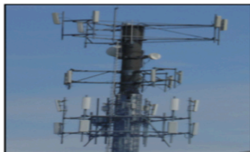
Winston Churchill Cell Tower

Peak Peel D.S.B. Classroom Spatial Average Radiation Levels Exceed Levels Found Within 100m of a Large Cell Tower